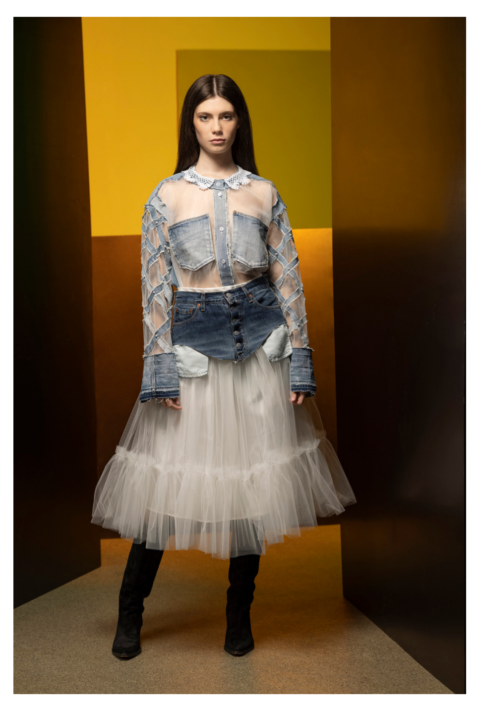
Elizabeth Shirt & Marie Skirt