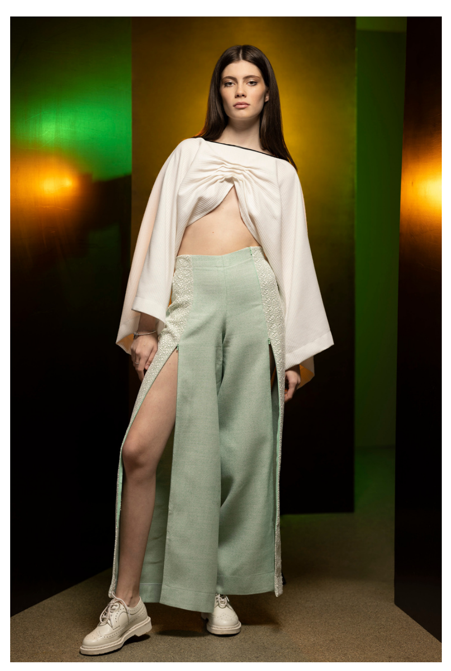
Nina Top & Kara Trousers