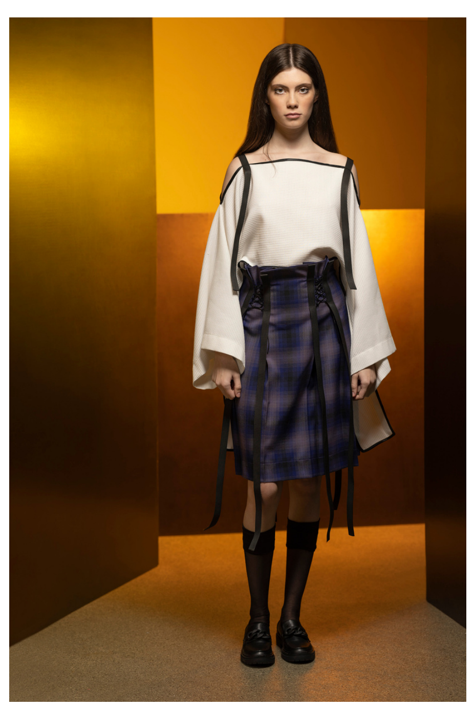
Greta Top & Anna I Skirt