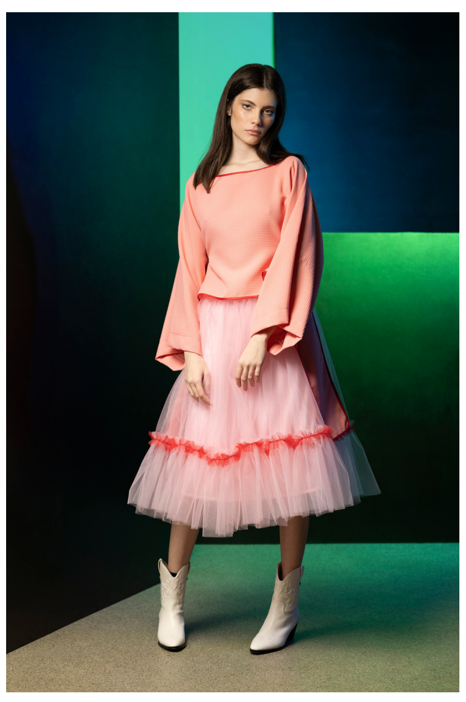
Marylin II top & Jasmine skirt