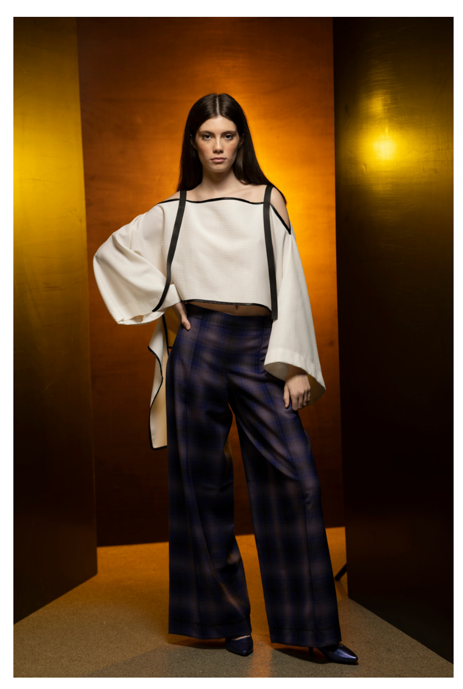
Greta top & Diana trousers