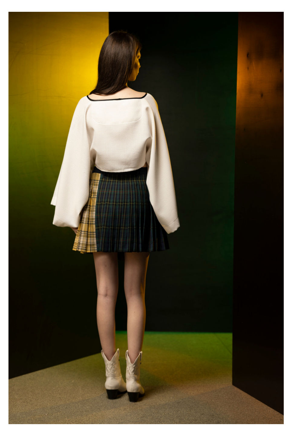
Sarah Skirt & Nina Top