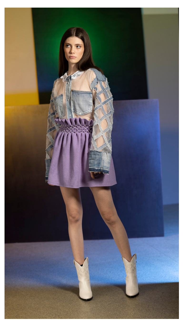
Elizabeth Shirt & Daisy Skirt