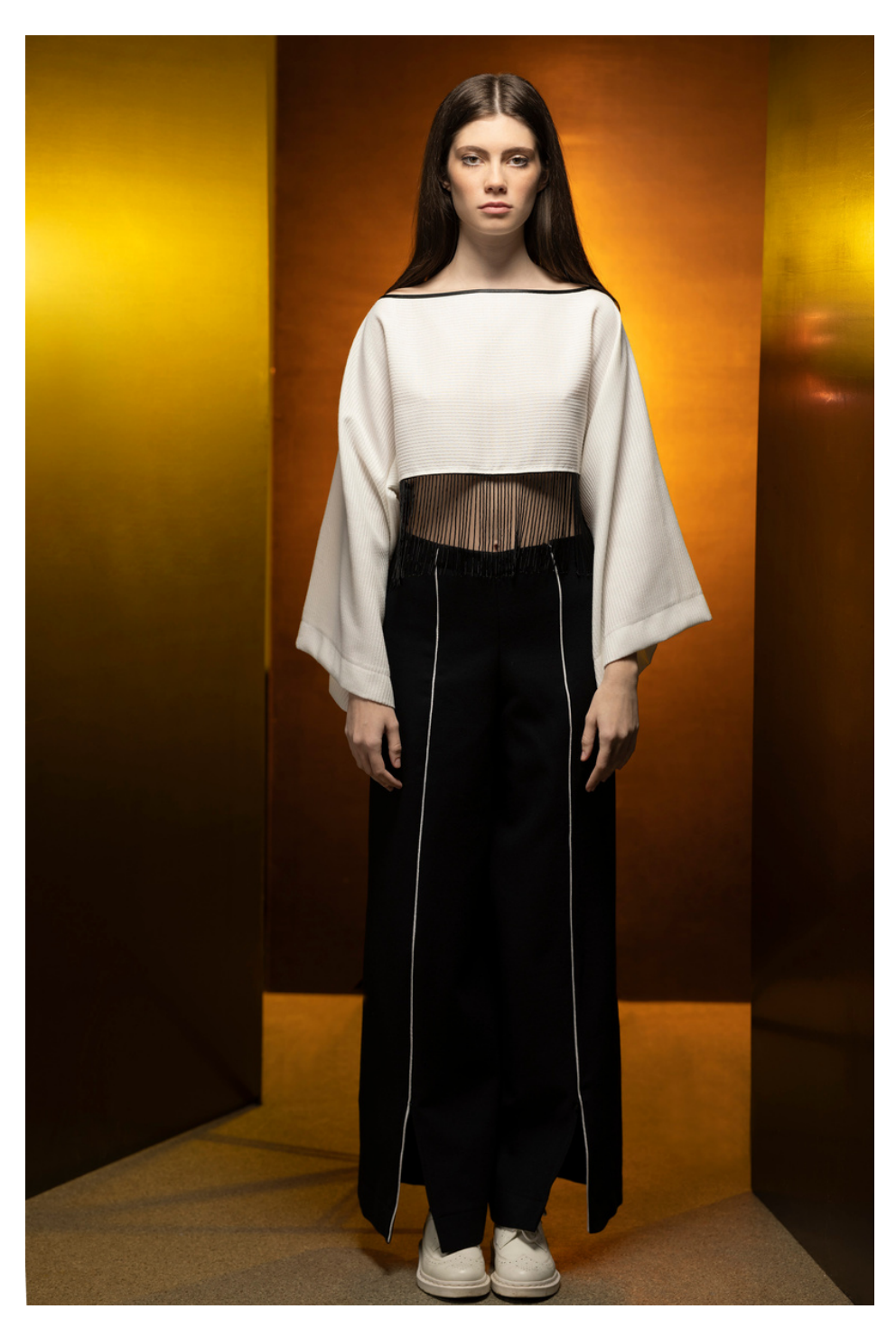
Clara top & Louise trousers