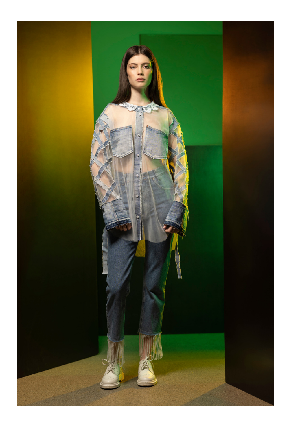
Elizabeth shirt & Denise Trousers