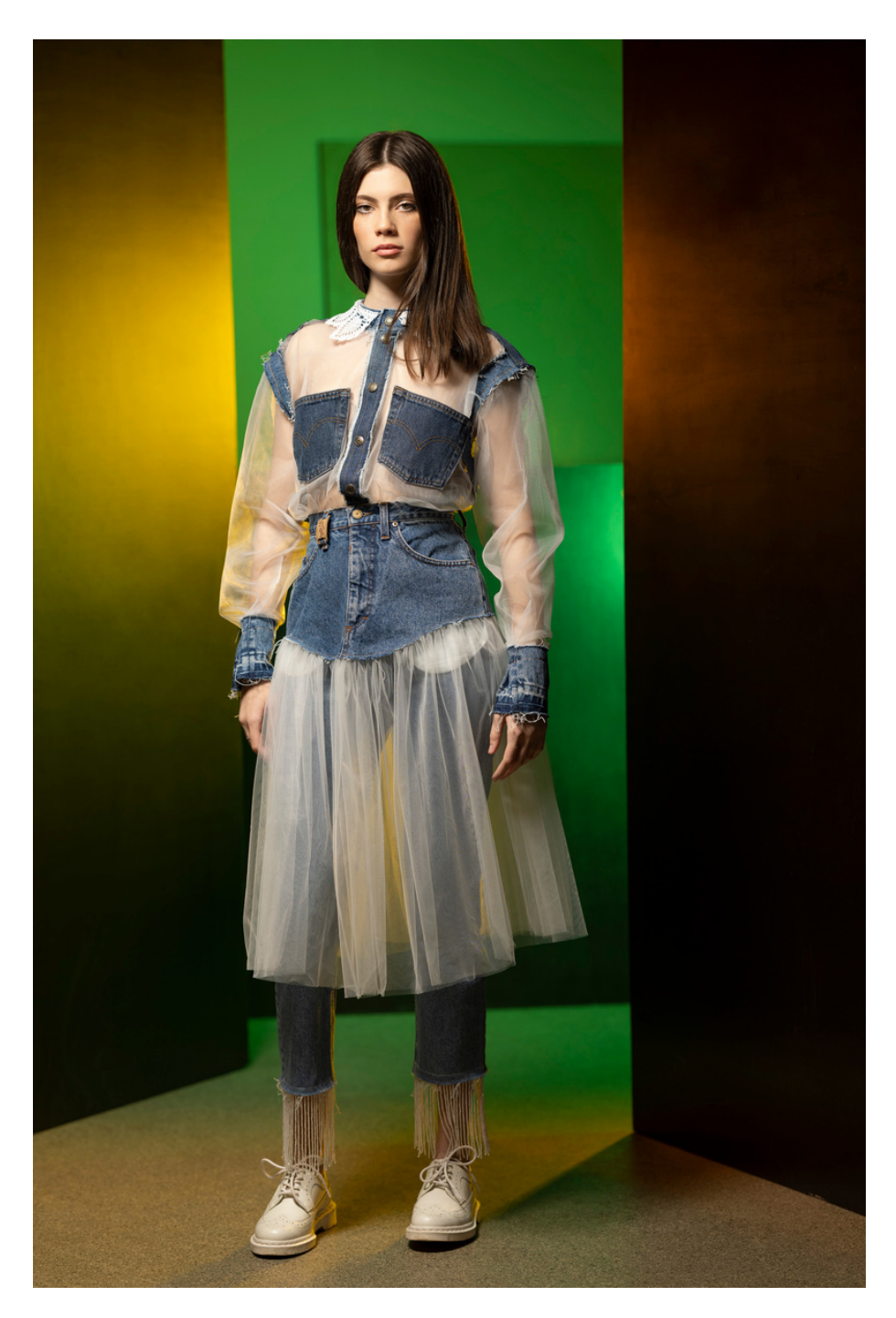
Victoria dress & Kora Trousers