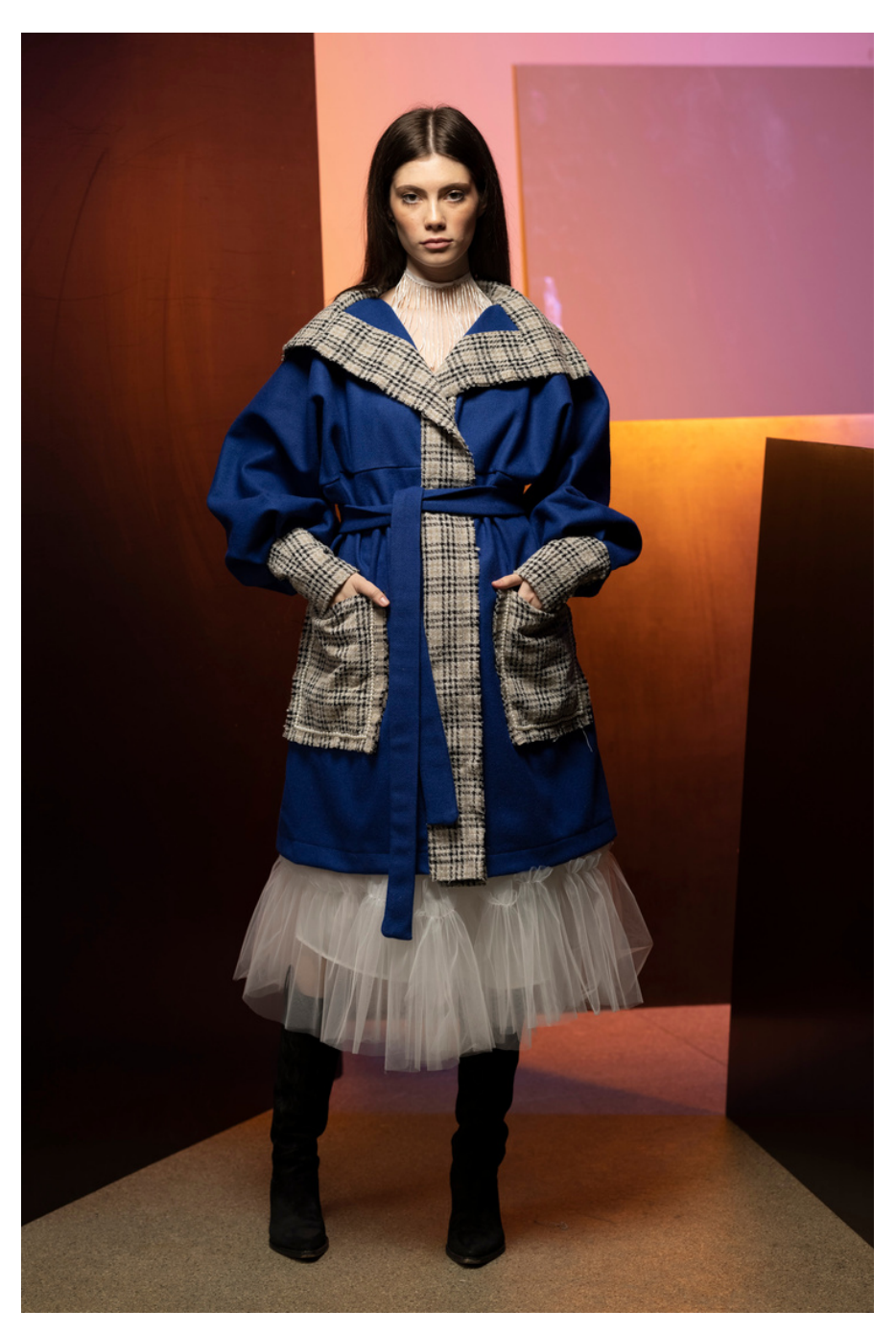
Marlene coat & Marie skirt