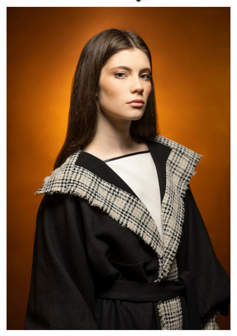
LOOKBOOK AUTUMN | WINTER 23/24'