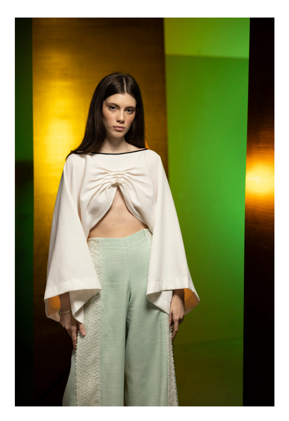
Nina Top & Kara Trousers