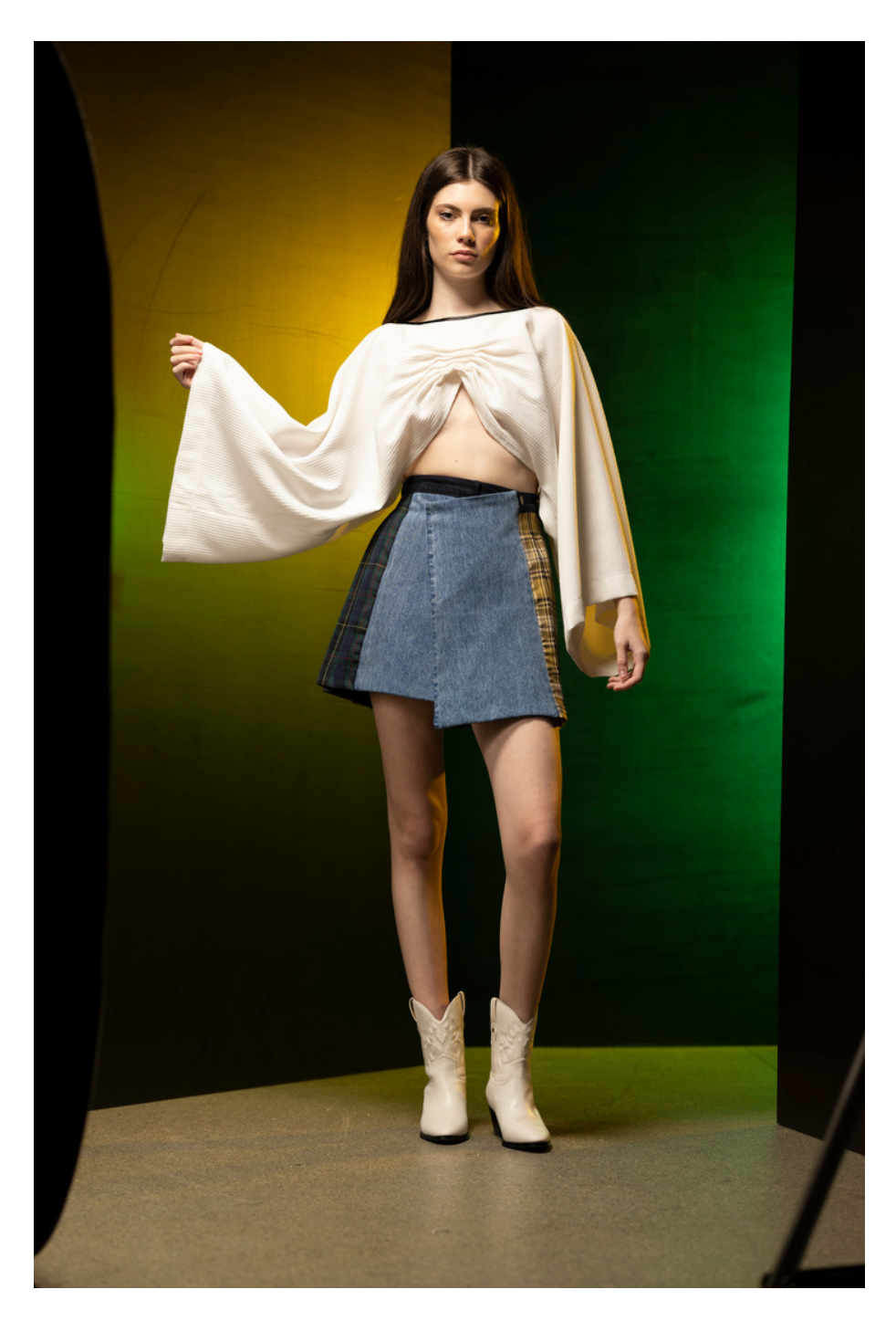
Sarah Skirt & Nina Top